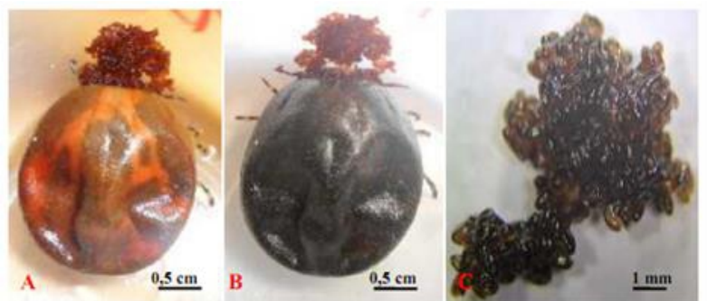
Photo 2. Laying female of A. variegatum treated with a 1/4 or 1/8 dilution of essential oil. A: early laying female; B: dead female; C: eggs

In contrast, these females survive and lay eggs when 1/4 and 1/8 dilutions of essential oil are applied (Photo 2). However, some females die during the oviposition period. Their bodies turn black just like the eggs they laid.