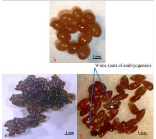
Photo 3. Different aspects of the eggs laid in control and treated females. (× 40)A: healthy eggs laid by a female in control; B: blackened eggs laid by a female treated at a dilution of 1/4; C: eggs with the onset of embryogenesis laid by female treated at a dilution of 1/8.

In addition, among eggs laid by females A. variegatum treated with the essential oil diluted 1/8 and transferred to new boxes, some eggs showed the onset of embryogenesis (Photo 3C) that ultimately failed. This rough embryogenesis, although characterized by a white spot that appears in each egg, shows that the eggs have been completely emptied of their contents. This excludes any egg evolution. The essential oil has been effective on eggs and their evolution due to treatment of females.