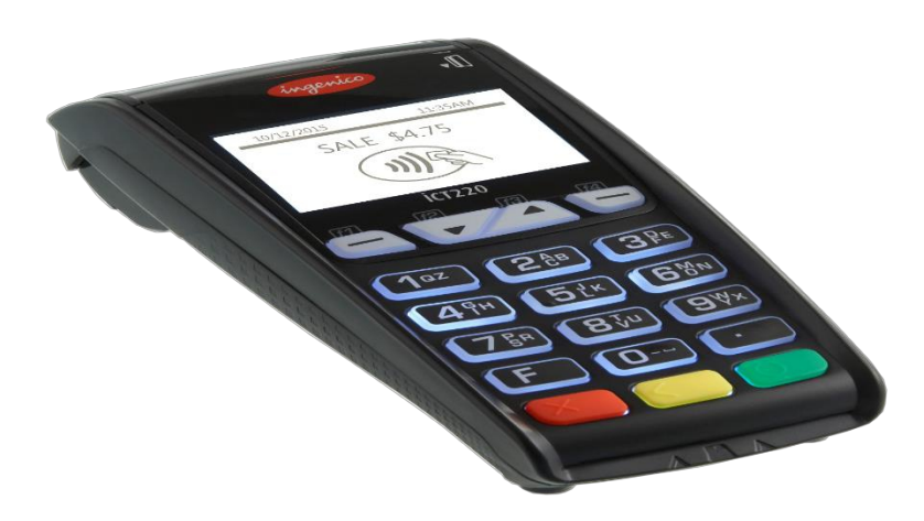
Figure 1: Point of Sale Terminal with a Thermal Printer (Adapted from Deloitte, 2017)