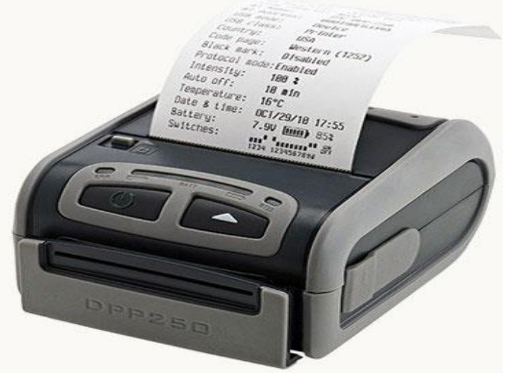
Figure 2: Bluetooth Thermal Printer (Adapted from Datecs, 2017)

Bluetooth thermal printers are a new technology that have made it possible to process payments through the use of conventional mobile phones (István, 2008). They serve as an add-on that provides the possibility to print directly from mobile phones thereby leveraging on the computational abilities of smart phones (Leonardo, Beniamino, & Marcello, 2014). Figure 2 shows a Bluetooth thermal printer. These devices are light weight, have a long battery life and also offer high printing speeds of around 60 mm/s (480 dots/sec).