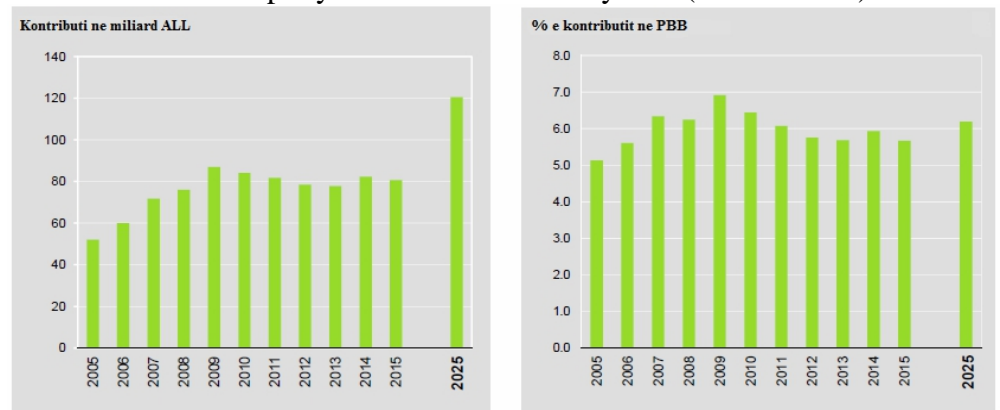
Fig. 1: The contribution of the tourism sector in Albania

By 2025, the tourism sector will enable up to 62,000 direct jobs, with an increase of 2.2% per year over the next ten years. (WTTC 2015)