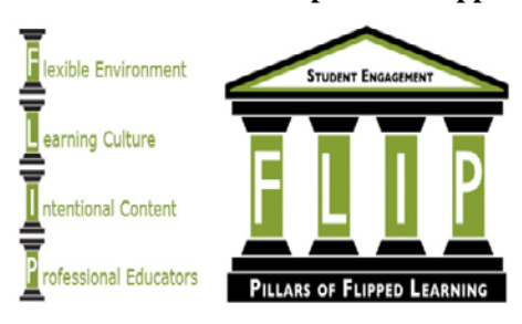
Figure 1.1. The four educational pillars of flipped learning

Visual depiction of The Four Educational Pillars of Flipped Learning showing support for student engagement. Copyright 2014 by the Flipped Learning Network.