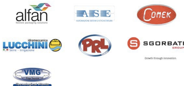
Figure 2. AgriBusiness Cluster Brixia – the partners’ logos

In order to gain more trust, which also depends on the very name and reputation of the business aggregation, the Cluster requested an additional support from Apindustria Brescia. This is the association for Small Enterprises that all the partners are associated with. For its patronage to the Agribusiness Cluster, the network website and every communication and document released and printed show the logo of Apindustria Brescia.