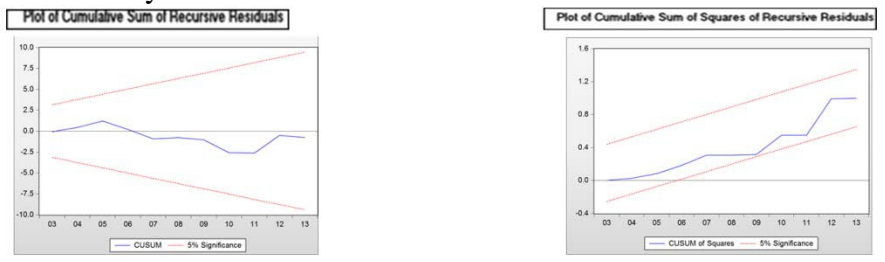
Figure 1. Stability Test for RGDP Equations

within the critical 5% bound for the period, and hence, the coefficients are stable and they do not suffer from structural break in the cumulative sum.