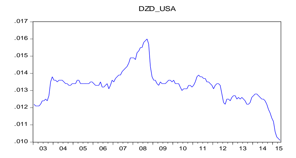
Let P, P* and P** represent the domestic price and the foreign prices ((based on 2010=100). The sample of each time series comprises 149 monthly observations for the period 2003 M1 – 2015M5, while transformed into natural logarithms. These variables are collected from different issues of the IMF's International Financial Statistics and the DataStream.