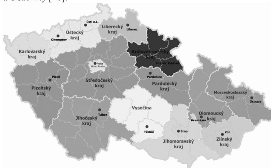
Figure 2: Prevocational Rehabilitation Centres in the Czech Republic

internal, oncological, visual, auditory, mental and psychological impairment. Patients with a long-term or permanent impact of injury, disease or inborn defect also need other means of rehabilitation (medical, social, educational prevocational and vocational), according to individual needs of the people with a disability [10].