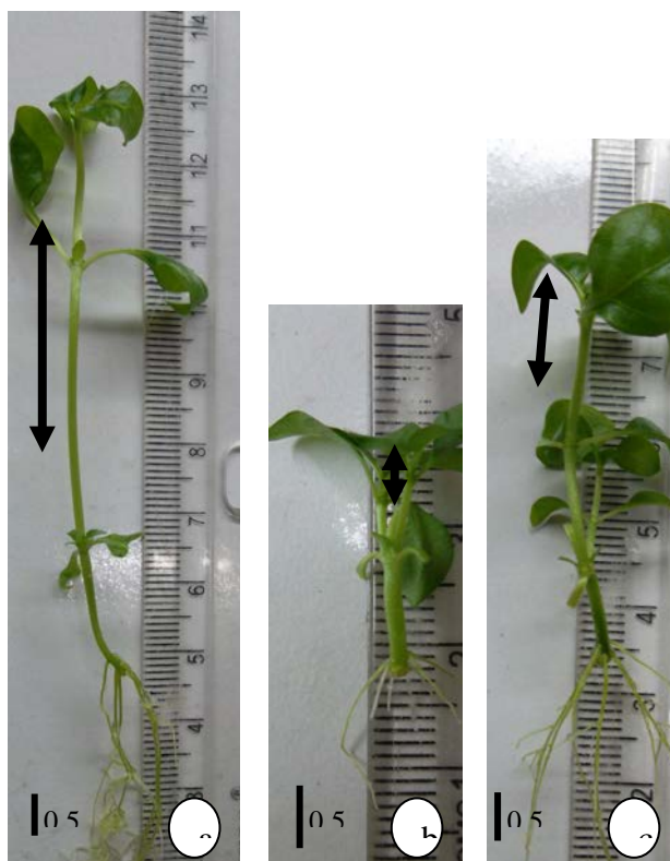
Figure 2: seedlings developed from apical (a), middle (b) and basal nodes (c) after six weeks culture = Length of the internodes

Average ± standard deviation of the measures made on 20 explants and repeated twice. The values affected by the same letter in the same column, are not significantly different according to the test of Newman-Keuls in P < 0. 05.