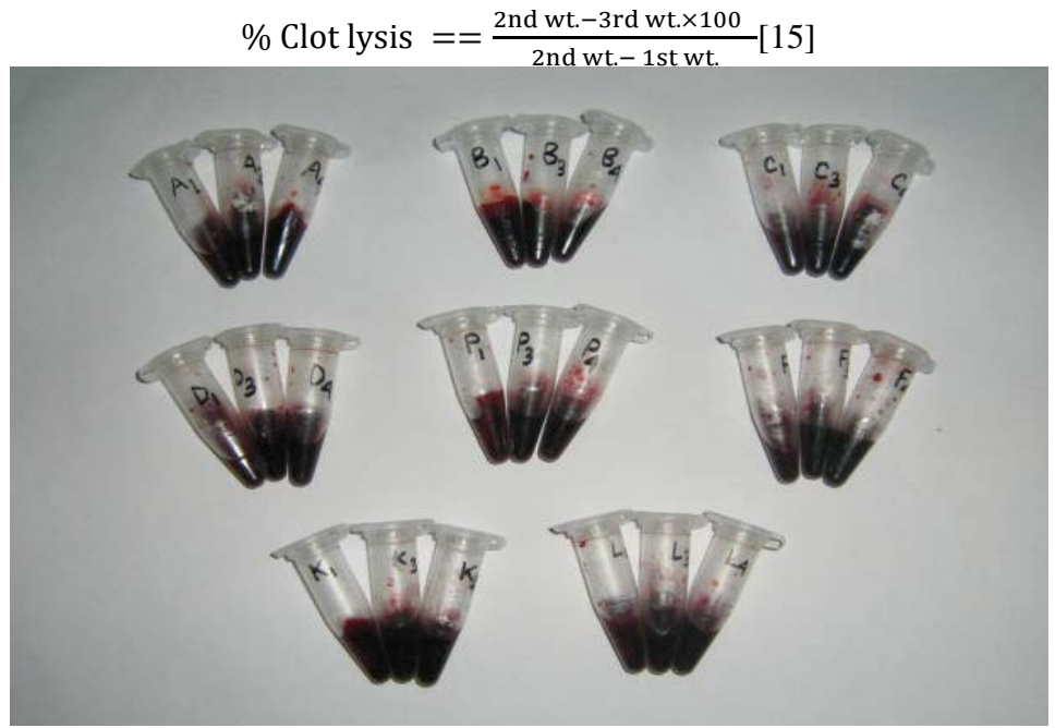
Figure 1: Micro centrifuge tubes used in the experiment. Result and Observation

lysis. The experiment was repeated 20 times with the blood samples of 20 volunteers <sup>[10, 11, 12, 13, 14, and 15]</sup>.