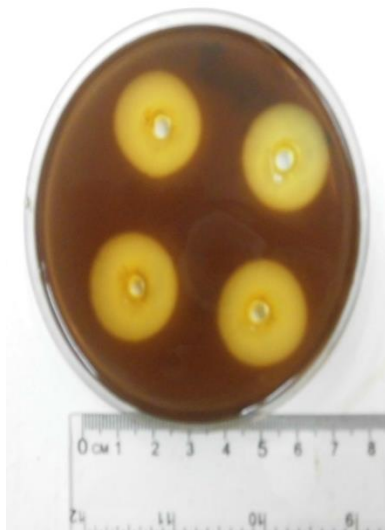
Figure 1: Enzyme production (amylase, pectinase, cellulase and phytase) by the selected Bacillus strains. The agar wells were inoculated with the bacterial suspension. The appearance of clear zones after 48 h of incubation at 30°C around the wells indicates enzymatic activity.

The 42 presumptive Bacillus spp. showed different production levels of the studied enzymes indicated by the presence of halos diameters ranging from 0.8 to 3.5 cm around the wells (Fig:1).