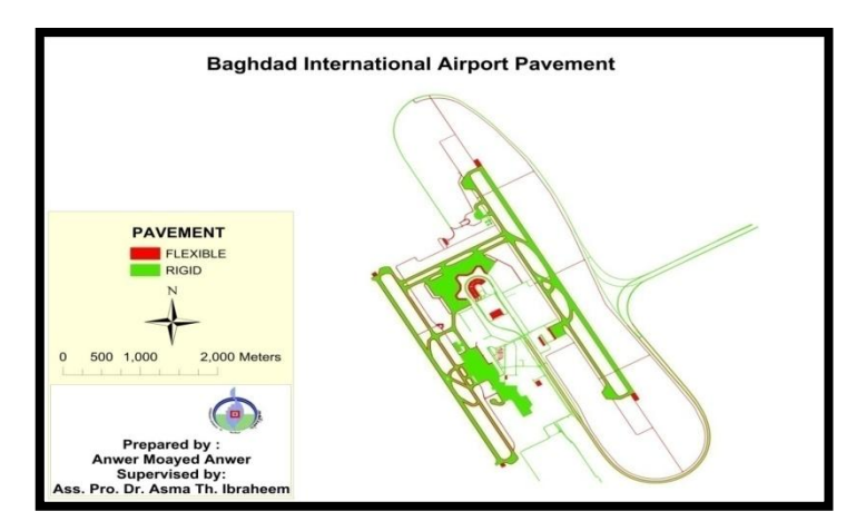
Figure (4): BIAP Pavemen

These two maps were produced according to the rules of drawing and production of maps and utilized from the Engineering Unit in Baghdad International Airport