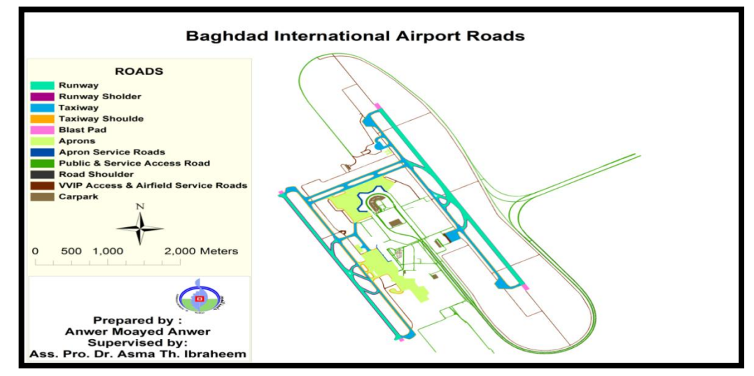
Figure (3): BIAP Roads

Two final maps were developed, the first image as shown in figure (3)includes (BIAP Roads which represented in eleven layers, scale bar and compass direction), the second image as sown in figure(4) includes (BIAP pavement which represented in two layers, scale bar and compass direction).