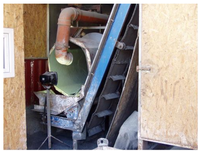
Fig. 6 Part of the compactor. As you can see, it is an experimental device