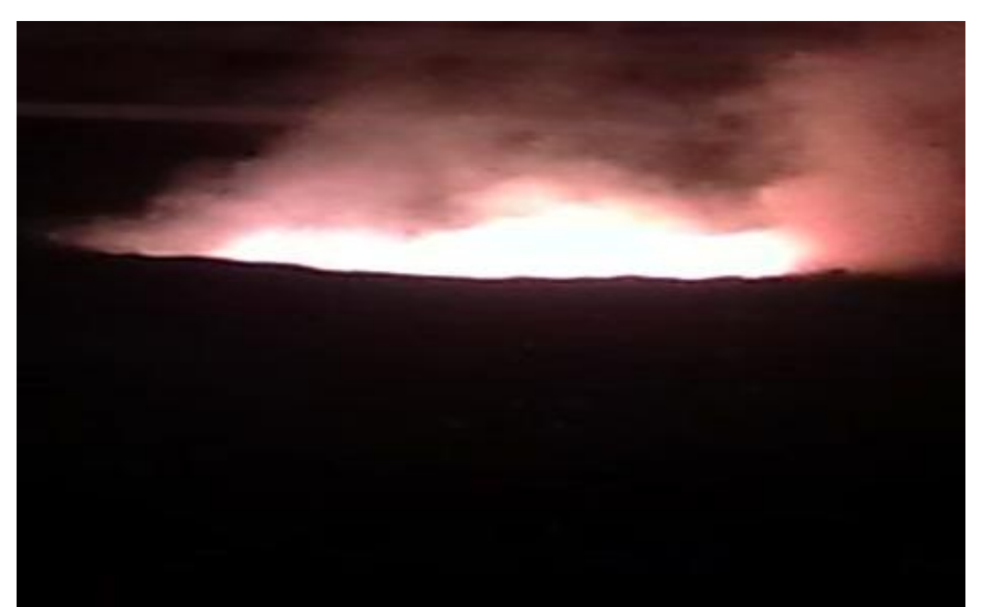
Fig. 13 Active lower blow after transport to the vacuuming station, again fumigation