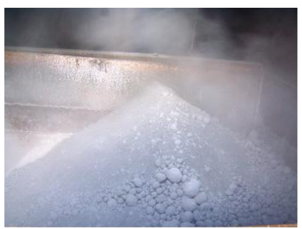
Fig. 5 First experiments with liquid binders, partially disintegrated pellets

4. Cooperation with VRP FBERG Kosice This joint project set many objectives, which should result in creating useful products from waste that would otherwise end up in a landfill. To meet this objective we aim to develop, construct and operate technological line, in which the process of production would be possible to control and check at any point.