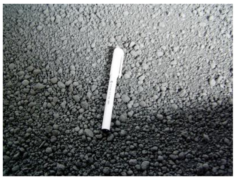
Fig. 10 Product 3-10 mm