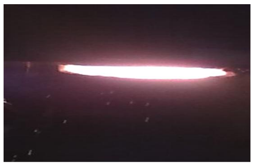
Fig. 14 End of fumigation at the vacuuming station, the reactivity of slag conditioner closed