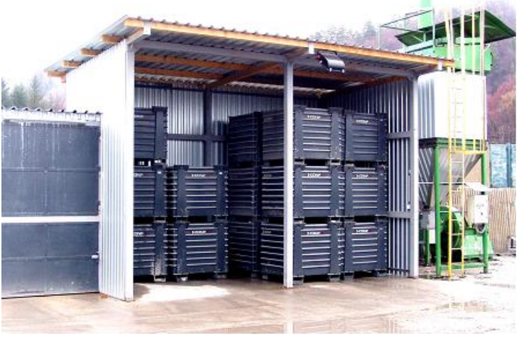
Fig. 7 Dusted final drying box and a buffer store

On the next figures there are the sieved products of the compacting of different grain size.