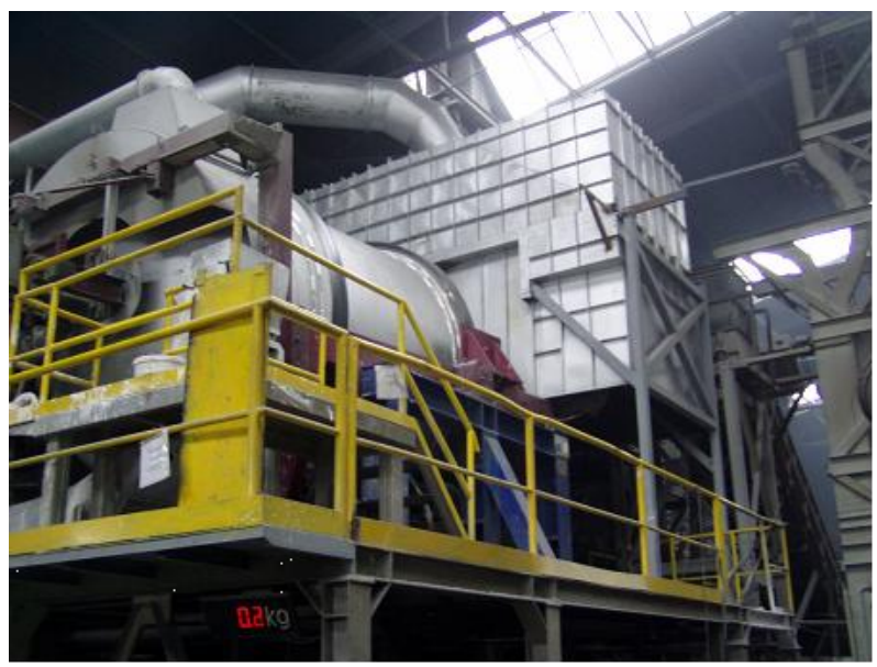
Fig. 1 10 ton – low salt rotary furnace

The company has about 100 employees, deployed in two operations the first operation is the purchase and pretreatment of scrap, the second operation is the production of alloys and processing of the waste from the smelting - aluminum dross. Annual production is currently about 11000 tons of alloys and about 5000 tons of slag conditioner for steel plants based on waste from melting.