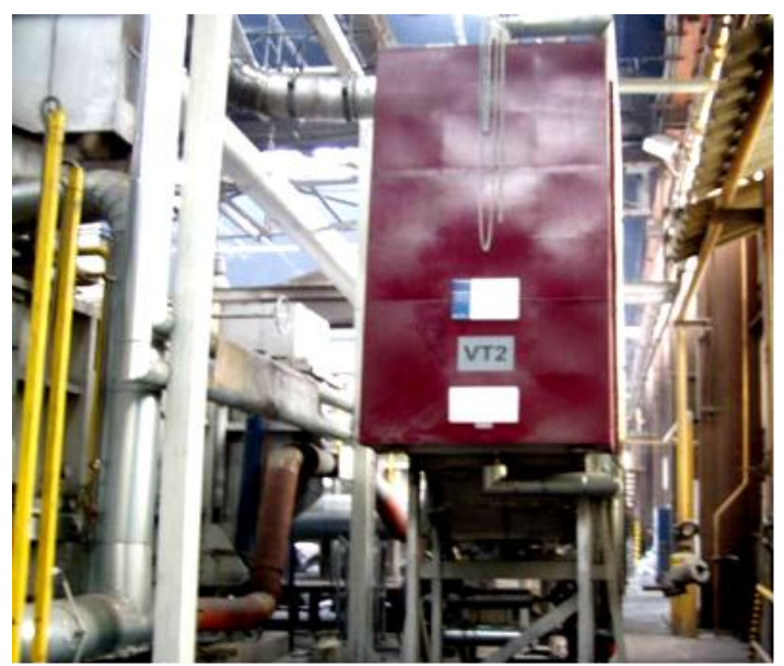
Fig. 3 Heat exchanger air - exhaust gas