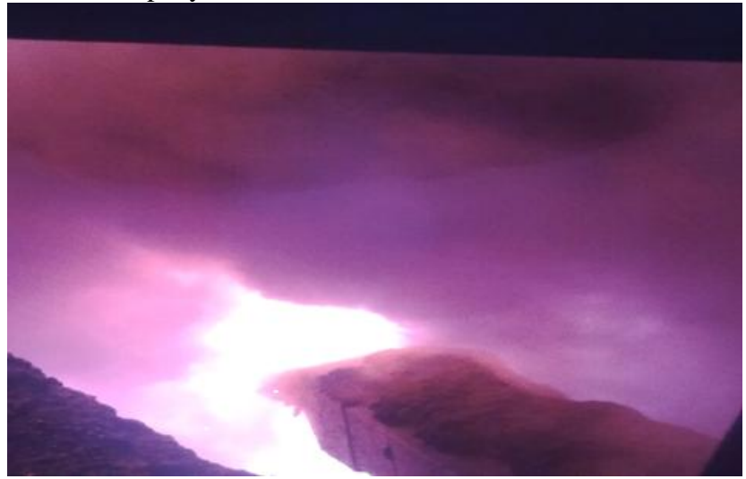
Fig. 11 Addition of slag conditioner at bar gauge, its disintegration is causing fumigation at the moment when it begins to blow through the bottom of the pan

Based on the partial results, in cooperation with VRP FBERG TU Kosice we have gradually built an experimental pilot production line for further research. The production of slag conditioners, desulfurization additives and additives for removing neck buckles of convertors has started in Confal Inc company.