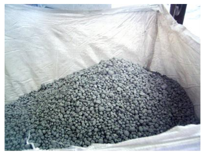
Fig. 9 Product 10-15 mm