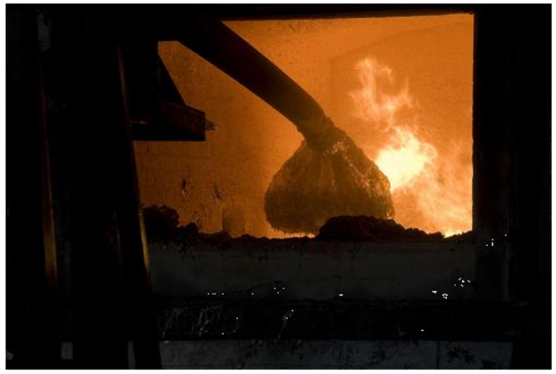
Fig. 2 The view to the smelters