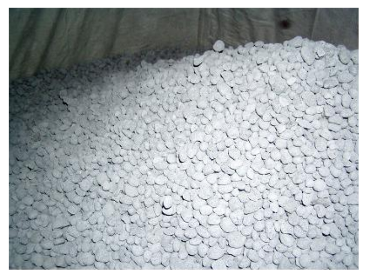
Fig. 8 Product 15-20 mm