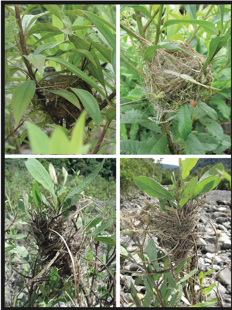
Figure 2: Nests of Coopmans's Elaenia Elaenia brachyptera , province of Napo, Ecuador (above). Naturally accumulated clumps of detritus that are scattered throughout the nesting habitat of Coopmans's Elaenia (below) (H. F. Greeney).