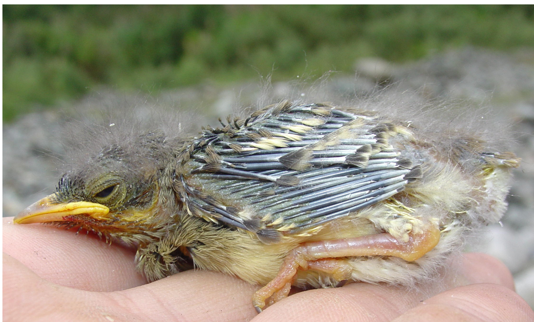
Figure 4: Mid-aged nestling of Coopmans's Elaenia Elaenia brachyptera , 8 November 2006, province of Napo, Ecuador (H. F. Greeney).

With respect to basic nest form (open-cup), as well as egg form and coloration, information provided herein for E. brachyptera is clearly well-aligned with previous descriptions for the genus (see above). Similarly, a mean clutch size of 1.7 ( n = 6 clutches; Table 1) follows general latitudinal trends towards reduced clutch size nearer the equator both within the genus Elaenia and for birds in general (Patten, 2007; Jetz et al. , 2008). The resemblance of nests to flood-accumulated detritus has not been remarked upon for other species of Elaenia , and it is not known if the nesting of E. brachyptera is restricted to river floodplains. We encourage additional nest descriptions for this species, whose breeding remains unknown from other portions of its range (del Hoyo et al. , 2018a). Testing the validity and effectiveness of this interesting form of mimetic nest crypsis will no doubt provide interesting insights into the species' natural history.