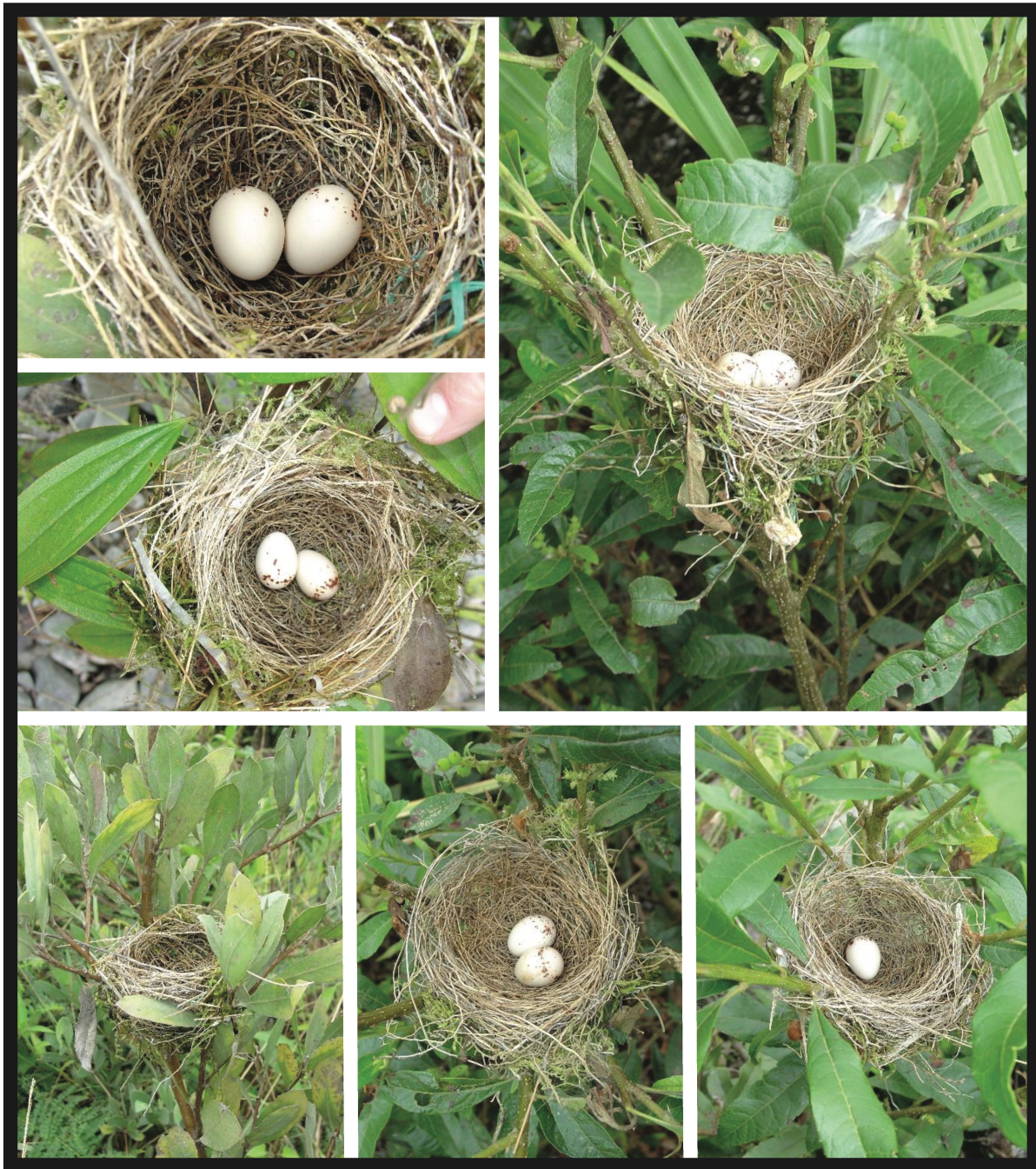
Figure 1: Nests of Coopmans's Elaenia Elaenia brachyptera , province of Napo, Ecuador (H. F. Greeney).