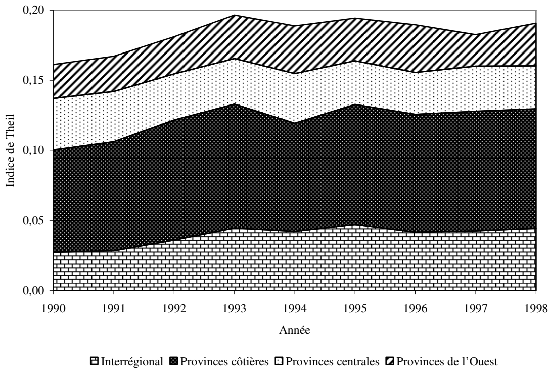
Figure 1 - Decomposition of the Theil Index : Real GDP per capita