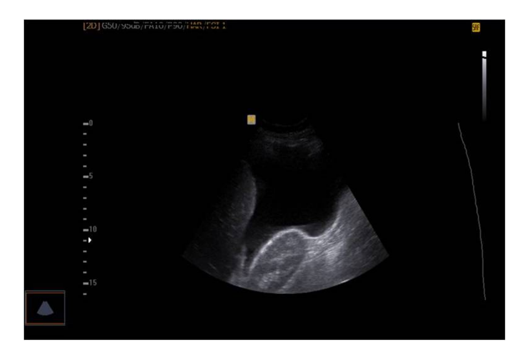
Figure 1: Abdominal ultrasonography revealed marked intraperitoneal collection.

Leukocytosis (WBCs=18000/mm³) and mild anemia (Hemoglobin=10 gm/dL). Ultrasonographic evaluation revealed a single living fetus with average biometry of 24 weeks, drained amniotic fluid and low implanted placenta below the presenting part on the anterior uterine wall reaching the site of previous scar. She had a history of cesarean section (CS) in her first pregnancy due to intrapartum fetal distress 2 years ago.