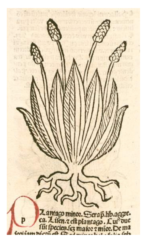
Figure. 1 The plantago minor from the Hortus Sanitatis, 1497 (viiiv).

What was needed was both a new standard in naturalistic representation and an exponential improvement in the art of cutting woodblocks to create realistic images capable of conveying the subtleties of inseparable accidents taken from de novo observations.