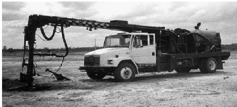
Figure 1: An example of a MOR vehicle.

The MOR unit is an artificial lift system which is used to exploit wells whose production is marginal. It consists of a truck (vehicle unit) equipped with an apparatus, see Figure 1. Considering a working day, the unit starts its tour at the depot, then it pumps several wells before returning to the depot. At each well, the driver spends some time to connect the unit to the well, to pump the oil and to disconnect the equipment. Whenever the unit's tank is full, an auxiliary vehicle is used to transfer the oil from the MOR unit to its own tank and to carry it back to the depot. Thus, the MOR unit does not need to stop its operations and its capacity can be considered unlimited.