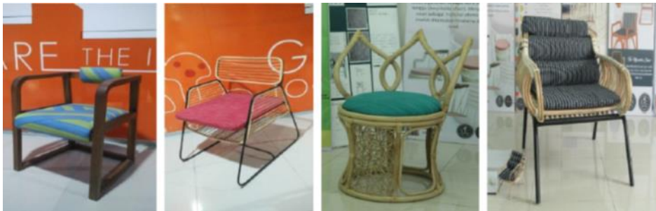
Figure 4 Furniture designs exhibited at MIFF2018 and MIFF2019.