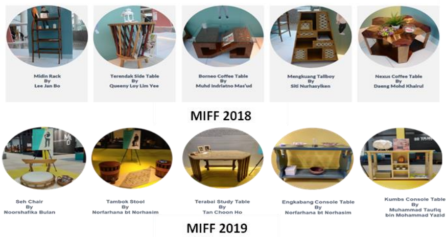
Figure 1 Furniture Designs exhibited at MIFF2018 and MIFF2019.

Figure 1 shows each five furniture designs exhibited at MIFF2018 and MIFF2019.