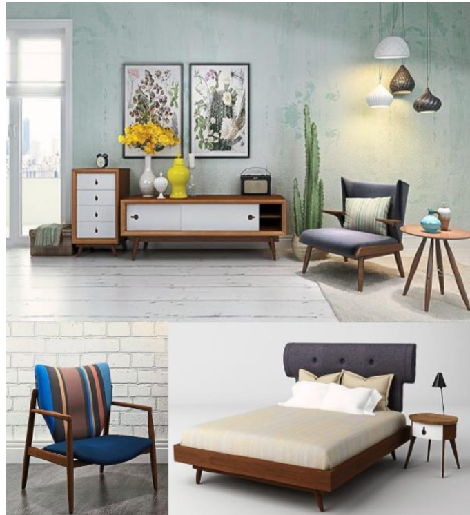
Figure 6 The N° 1 Collection of Philip Yap [10].

In 2015, Yap utilized a local hardwood, sepetir , in his N° 1 Collection, inspired by the mid-20 th century Scandinavian style (Figure 6). He believes that a good combination of color, fabric and shape, fused in a modern style is able to elevate the standard of local furniture design as a competitive advantage in the global market.