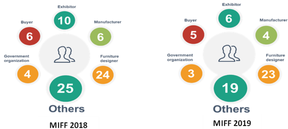
Figure 2 Visitor and participant survey at MIFF 2018 and MIFF 2019.

Figure 2 shows the number of visitors for each category during the MIFF exhibition in 2018 and 2019. The category Others includes industrial designers, suppliers, students, contractors and researchers among the visitors. In general, the survey results showed a positive attitude towards attempts to integrate cultural elements in furniture design. It is appreciated and perceived as a potential added value and competitive advantage of the products. However, there are some areas that can still be improved, including aspects such as ergonomics, safety and the materials used.