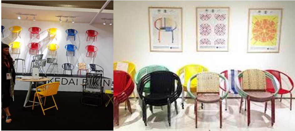
Figure 7 The Merdeka Chair in MIFF2018 at MITEC, Kuala Lumpur, 2018.

The designers refer to several elements: rebranding an artefact that was popular during the Merdeka era and the colors of Malaysia Jalur Gemilang to connect to Malaysian culture and heritage as the identity of their product.