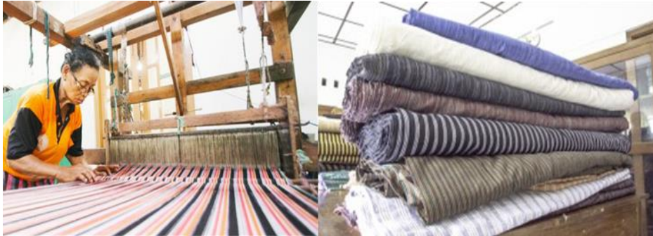
Figure 3 Lurik handwoven fabric 2017.

aesthetic feature of furniture has high potential and is recommended to be further explored and developed. The findings of the study suggest that in order for furniture designs with cultural elements to be well received by the global market, the development of new motives or patterns such as lurik is crucial and should be done continuously. Four pieces of furniture with lurik designs are shown in Figure 4. Moreover, Figure 3 shows the weaving process of lurik fabric designs using a traditional weaving loom.