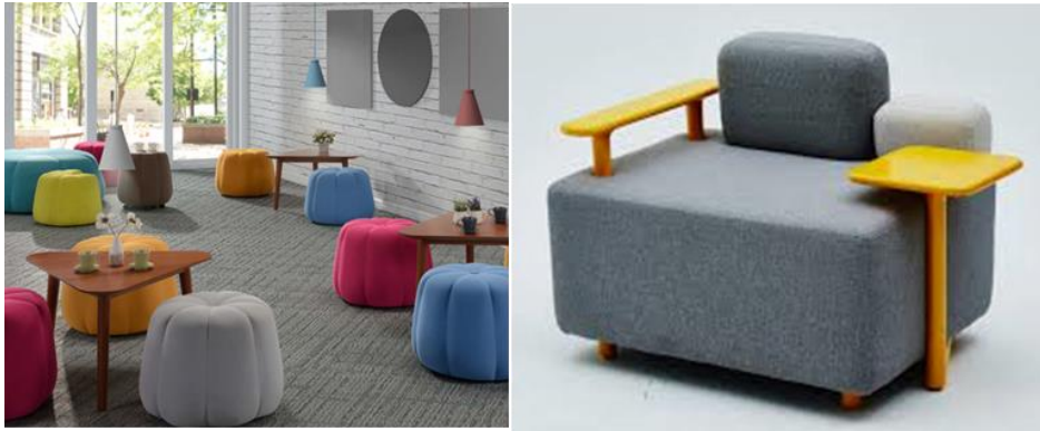
Figure 9 Lolla Collection and Gill Sofa designed by Sujak [Images] 2018 from www.oasis.com.my [11].

The Lolla Collection of stools designed by Sujak is inspired by a Malay traditional delicacy, kuih bahulu . Sujak uses a storytelling approach in his designs (Figure 9). He finds it very important to convey culture and arts in the form of a story and translate it into a product. Malaysian designers should take the opportunity to introduce multicultural elements to the world as a product identity. For example, bahulu is sweet Malay kuih , served during the festive season and ceremonies such as Hari Raya. Sujak translated it into stools with various sizes and vibrant colors to reflect the harmonious living culture of the Malay and the joyous experience of the festive season.