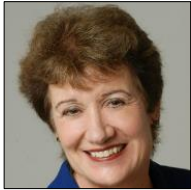
Christina Maslach, PhD Professor Emerita of Psychology University of California at Berkeley

Presentation: Meeting the Challenge of Burnout