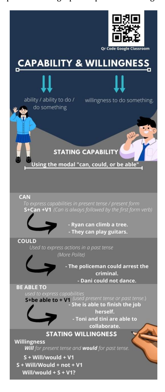
Figure 3. The Infographic for the Second Topic

It can be seen from Figure 2 that the first topic was about asking and giving attention. On the infographic, detailed yet concise information was provided in an interesting way in order to help the students in better understanding the materials. As stated beforehand, the infographic also included a Quick Response (QR) code so that the students could scan and access the Google Classroom and did the rest of the learning activities. Another example of the infographic is presented in Figure 3.