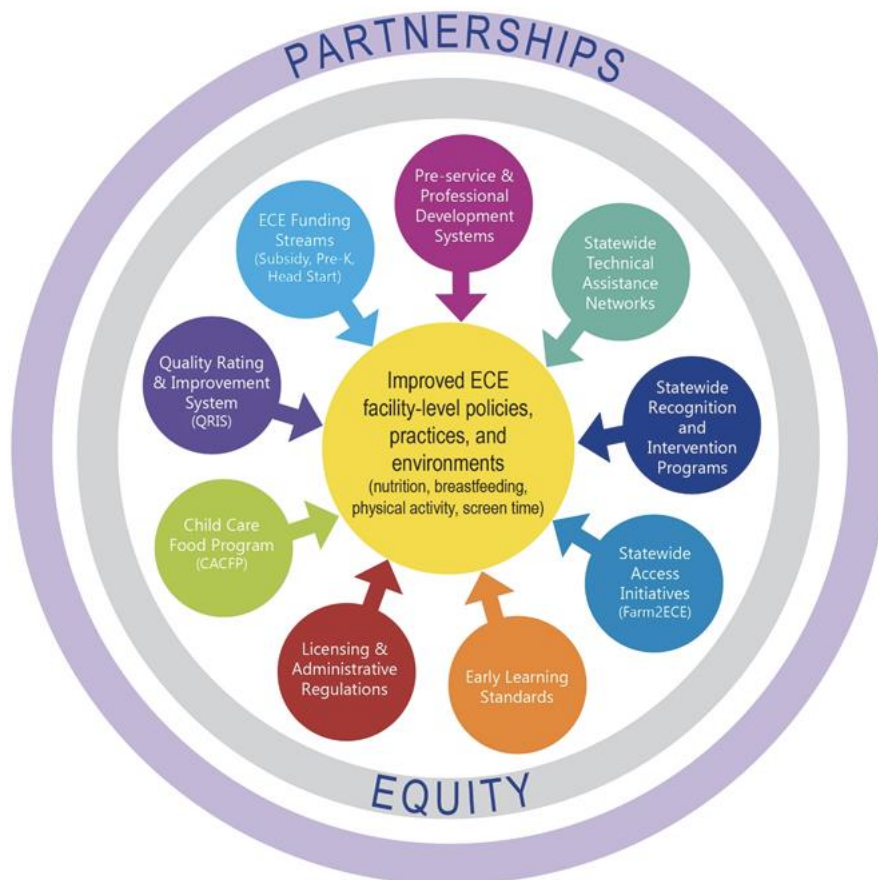
Figure 2. The Spectrum of Opportunities Framework for State-Level Obesity Prevention Efforts Targeting the Early Care and Education Setting

The WV Healthy Children Project was informed by both frameworks which feature opportunities to impact childhood obesity and are closely aligned with Extension's organizational and programmatic strengths. Extension's strengths include a national network of respected and trained community educators and expertise in relevant areas of community engagement, such as nutrition, physical activity, parenting, and youth development. Moreover, Extension educators employ a comprehensive approach to engagement, leadership, and action. According to the IOM, solutions to help address the obesity epidemic must come from multiple sources (individuals, organizations, and agencies), involve multiple sectors at various levels, and incorporate multiple comprehensive prevention strategies (IOM, 2012a). Given the complex and pervasive nature of childhood obesity, it is imperative that Extension is at the table and accepts the challenge to actively engage in a broad range of obesity prevention efforts.