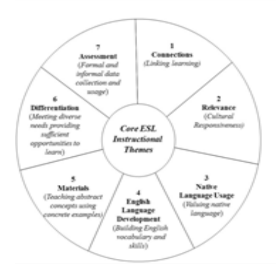
Figure 2 . Core themes for implementing research-based ESL practices.

the district population is ELs). Project participants included the staff of 20 educators (i.e., classroom teachers, principal, master teacher, support educators) in the kindergarten through fifth grade school site. Participants ranged in degree levels and years of experience completed both in and out of the district, with many holding a master's degree and several years teaching experience.