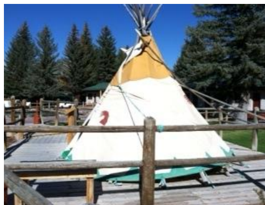
Figure 2. Tipi at Saratoga Resort

In addition to calculating the distances, slopes, and the equations of the lines, the grounds of the Saratoga Resort have smaller springs that are covered by tipis (See Figure 2). Students could estimate the amount of material needed to make one of the tipis as well as determine the surface area of a tipi using the formula to find the surface area of a cone.