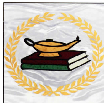
COLLEGE OF EDUCATION