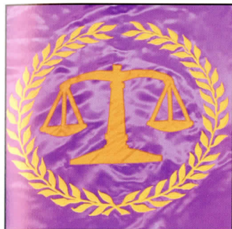
CECIL C. HUMPHREYS SCHOOL OF LAW