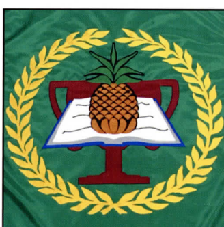
KEMMONS WILSON SCHOOL OF HOSPITALITY AND RESORT MANAGEMENT