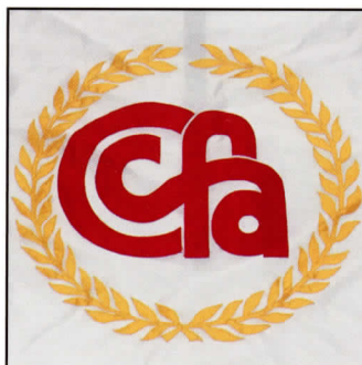
COLLEGE OF COMMUNICATION AND FINE ARTS