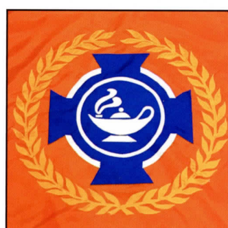
LOEWENBERG COLLEGE OF NURSING