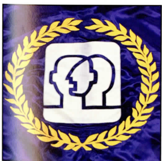
SCHOOL OF COMMUNICATION SCIENCES AND DISORDERS