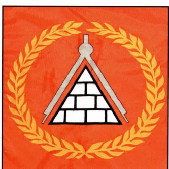
HERFF COLLEGE OF ENGINEERING