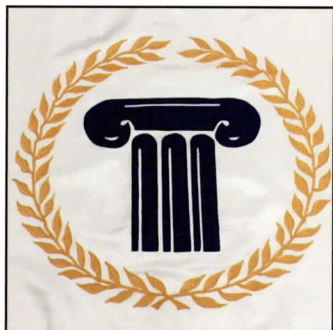
COLLEGE OF ARTS & SCIENCES