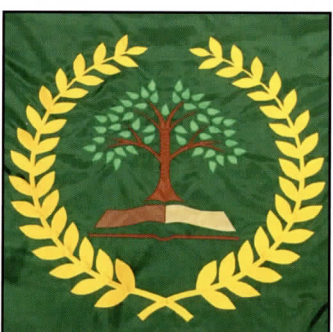
SCHOOL OF HEALTH STUDIES