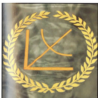
FOGELMAN COLLEGE OF BUSINESS & ECONOMICS