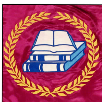
THE GRADUATE SCHOOL