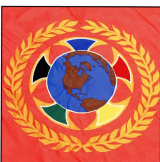
SCHOOL OF PUBLIC HEALTH