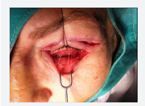
Fig. 2. Preserved motor branches of pretarsal orbicularis oculi muscle

We had only 8 complications, 3 limited hematoma which did not need to reoperation, 3 corneal edema and