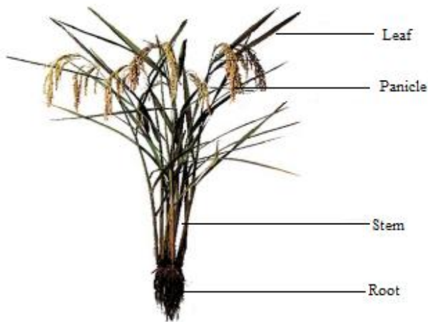
Fig. 2. Rice plant with various parts (Lacharme, 2001, modified)

The data do not follow a normal distribution; the Shapiro non parametric test was used. To study the probable links between the different variables, the Spearman r correlation test was made. P values were determined, if P \leq 0.05 ; the difference is significant.