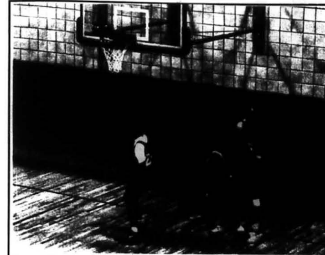
The men's basketball team has begun practicing for the upcoming season, which begins Nov. 20 at the Babson Invitational. Look for men's and women's basketball previews next in the Journal.

people at the women's basketball games. The teams at Suffolk deserve more support from their schoolmates. The teams that are successful need your continued support, and the teams that haven't been so successful need your support so they can grow into successful programs.