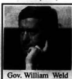
Gov. William Weld

A Forum On Justice, sponsored by WBZ-TV and Radio and Suffolk University, allowed special guests, Governor William F. Weld, Supreme Judicial Court Chief Justice Paul J. Liacos, State Senate President William M.