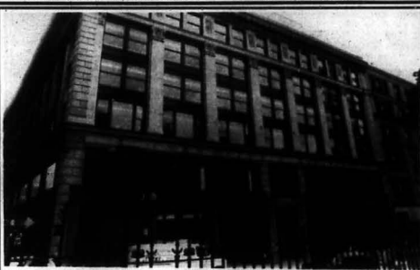
Possible future site of the Suffolk Law School, 110-120 Tremont St.

Suffolk University occupies the entire 25th floor of One Beacon Street, housing its senior administrators offices and business offices. Suffolk has been a tenant of the building since 1989. The largest tenant in the One Beacon Street building, publishing company, Houghton Mifflin Company, is in the process of