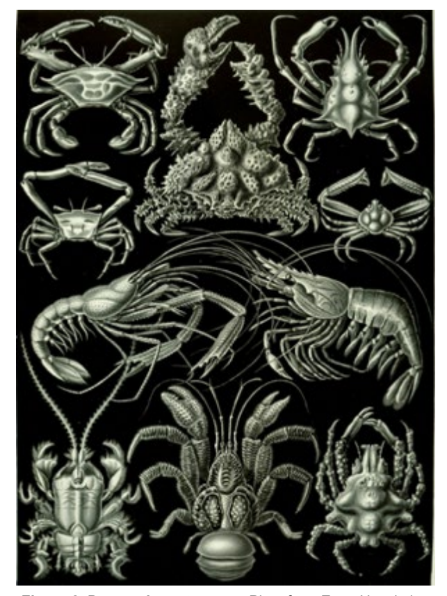
Figure 2. Decapod crustaceans. Plate from Ernst Haeckel, Kunstformen der Natur , 1904.