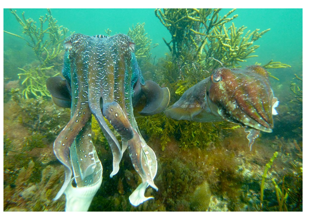
Figure 1. Cephalopod molluscs. From top to bottom: squid, octopus, cuttlefish.