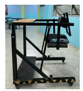
Figure 1. Transfer Lifter Assistor

The characteristics of the transfer lifter assistor include U-shape frame, allowing attachment to a bed or toilet, and detachable back barrier. With these features, patient can transfer from one place to another in sitting position.