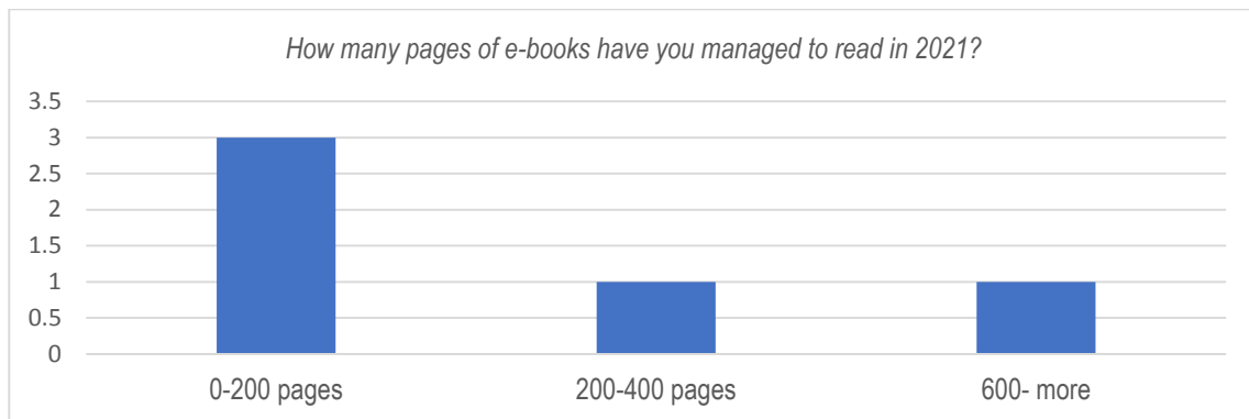
Figure 2: Female teachers' E-Book reading page rates

In Figure 2, it can be said that all female teachers spend time on e-reading, however they do not read digitally a lot.