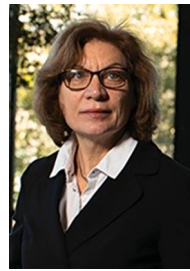
Queensland University of Technology and University of Maryland at College Park.