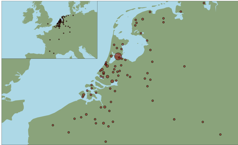
Figure 5: Birthplaces of inductees in the Panpoëticon.

endpoint. An endpoint for the NTA, STCN and DBNL datasets is provided by the KB. For the other datasets a (temporary) endpoint is provided by the University of Amsterdam, while a more permanent endpoint will be provided by the Golden Agents research infrastructure in the near future. SPARQL is the dedicated language to query RDF data. The logic behind SPARQL and its syntax are well documented, both in print and on the Web. But in practice, it is for the greater part learned by doing, as with most computer languages. So, for learning purposes as well as for the sake of reproducibility and replicability, the SPARQL queries that generated these outcomes used in the cases below, are included in the appendices.