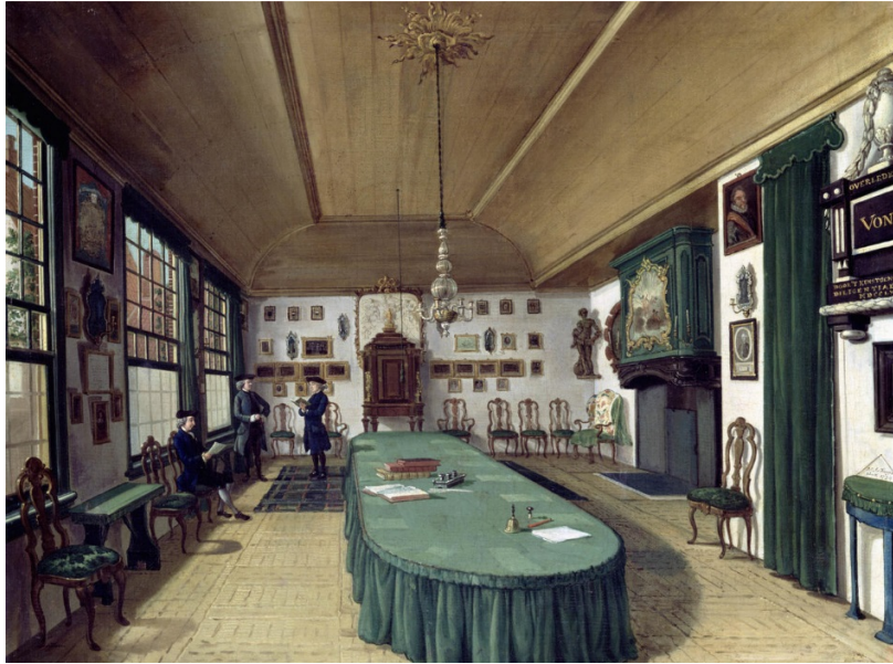
Figure 2: The meeting hall of the literary society Kunst Wordt Door Arbeid Verkregen with in the middle, at the end of the table the cabinet of the Panpoëticon Batavum. Paulus Constantijn la Fargue, oil on canvas, 1774. (Rijksmuseum Amsterdam / Museum De Lakenhal Leiden)

paintings up for sale. In a final, desperate attempt to clear its debts, it offered the Panpoëticon to the newly founded Koninklijk Museum, a direct precursor of the Rijksmuseum Amsterdam, for the hefty sum of five thousand guilders. Despite the fact that nationalism was by then the thriving idea in politics and culture, interest in the eighteenth-century and rather encyclopedic collection was limited and the society's offer was firmly rejected twice. The collection was eventually sold in 1819 and again in 1849. The then owner, a profit-driven art broker, sold the portraits separately and they ended up in collections all across Europe (Van Deinsen, 2017, 2020). The wooden cabinet itself was lost.