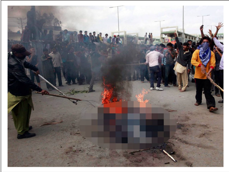
Figure 2. Bodily alignment in a vigilante ritual: Punishment of the offender.

Notes: An aligned audience has formed a circle, focusing on perpetrators. Caption taken from the source: 'Enraged Christian residents burn men they suspected of being involved in bomb attacks on churches, after lynching them in Lahore Pakistan'.