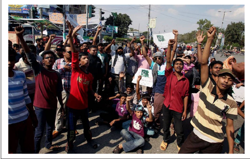
Figure 1. Bodily alignment in a vigilante ritual: Mobilization of a group.

Notes: Participants synchronizing their bodies in a vigilante ritual prior to the lynching. Caption taken from the source: 'Pakistani Christians chant slogans during a demonstration to condemn the suicide bombing attack on two churches, Sunday, March 15, 2015 in Karachi, Pakistan'.