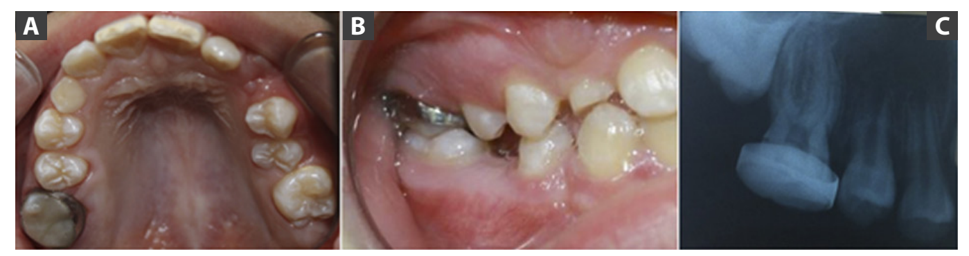
A. Restoration is intact; Glass ionomer without fracture and good marginal sealing. B. Marginal and papillary gum is in good condition in relation to the band. C. X-rays show that the restored molar has no signs of periapical lesions.

Figure 3. Molar with MIH treated with glass ionomer restoration and orthodontic band after 6 months of follow-up.