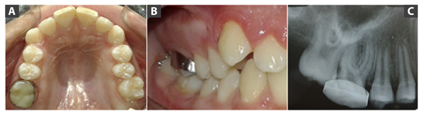
Figure 4. Interim molar treatment for MIH-affected molar still successful after 18 months.