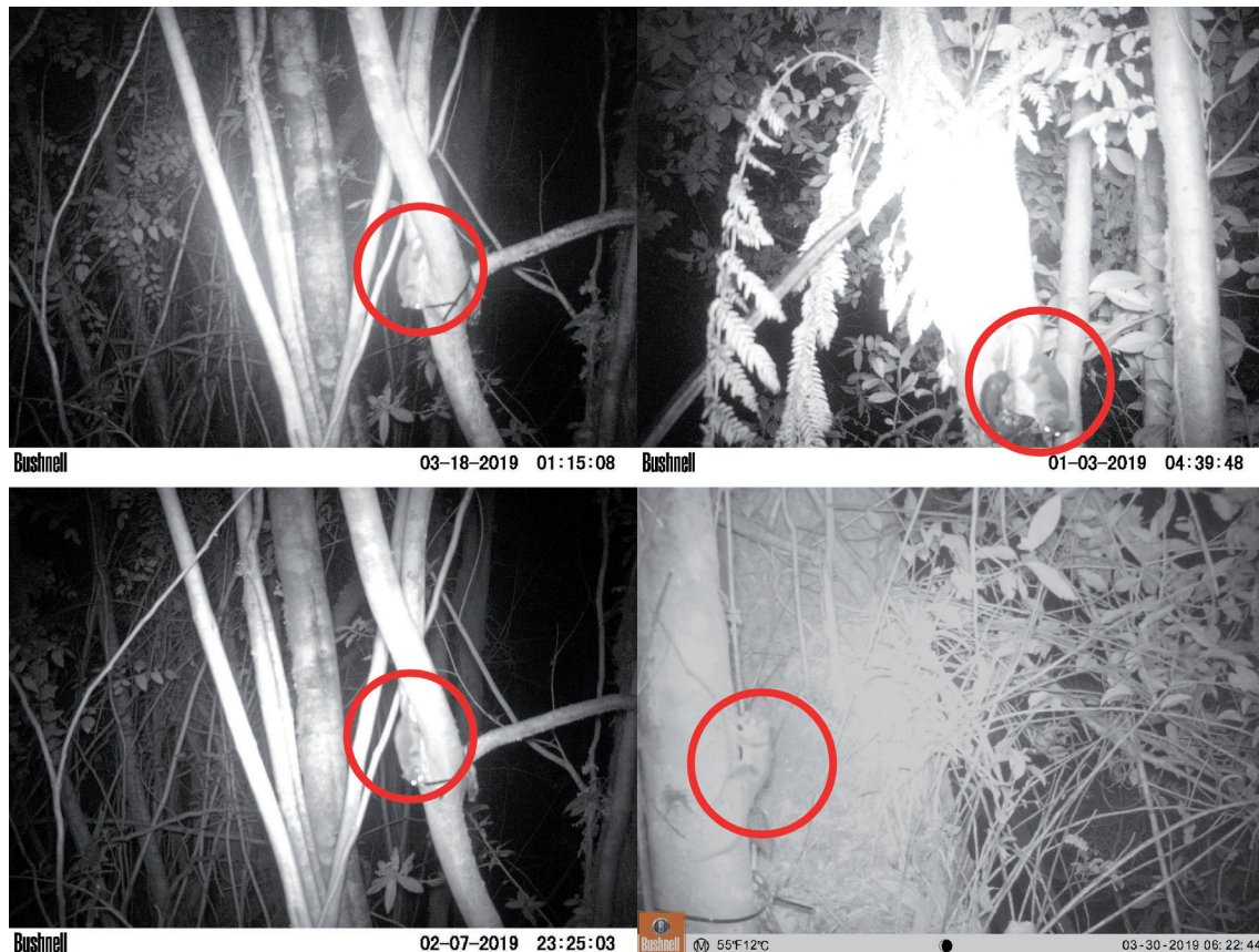
FIGURE 1. Camera trap records of Dromiciops gliroides at Chaitén and Futaleufú. / Registros de Dromiciops gliroides en cámaras trampa de Chaitén y Futaleufú.

We also examined D. gliroides activity patterns at the new locations (Fig. 3a), using the activity package (Rowcliffe 2019) in R 3.5.3 (R Development Core Team 2019). Activity starts at 19 h and ends at 7 h, being similar to the activity patterns previously reported for the Valdivian rainforest (Fontúrbel et al. 2014) but showing a narrower activity peak (Fig. 3b). We contrasted the activity patterns of Fontúrbel et al. (2014) against the pattern obtained here using the compareCkern function of the activity package, with 1000 permutations. We found an overlap of 82.45 \pm 0.04 % between both activity patterns, but the differences were marginally significant ( P = 0.053 ).