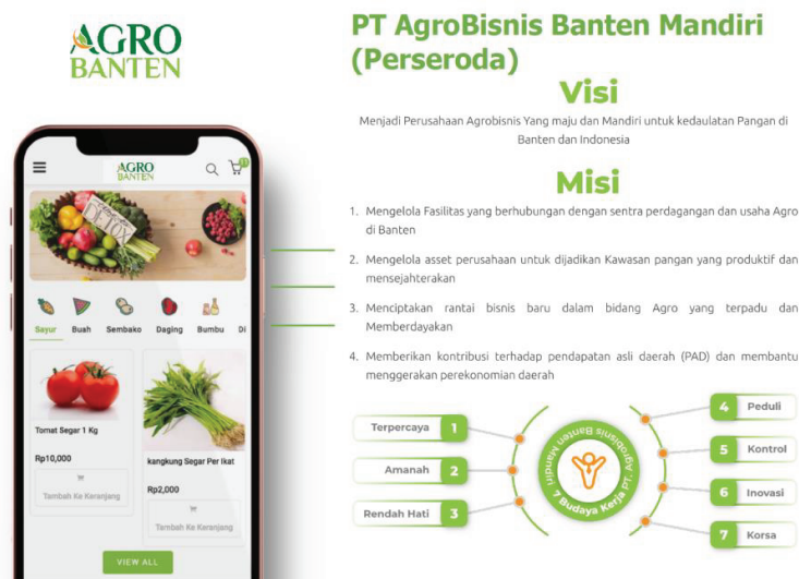
Figure 1: The AGRO BANTEN application managed by the Banten Province Regional Owned Enterprise.

In addition, the Banten Provincial Government's efforts to embody society 5.0 in farmer and agricultural governance in Banten Province initiated the presence of an Agricultural BUMD named PT AgroBisnis Banten Mandiri (Perseroda) which further facilitated the "AGRO BANTEN" application as a tool that makes it easier for buyers and sellers to transact. agricultural products will be able to answer the challenges and opportunities in the era of social change for farmers in the era of Society 5.0. The following is the display of the AGRO Banten website: