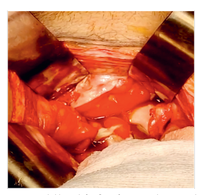
Figure 2. Urinary Bladder with free flow of urine into the peritoneal cavity

The omentum was pulled towards the urinary bladder area with dense adhesions. The pulled omentum was causing a band like constriction on the mid transverse colon and also over the mid part of the small bowel. A single approximately 10x3 mm rent was seen in the intraperitoneal part of the dome of the urinary bladder anterior to the rectum (Figure 2).