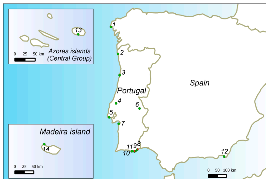
Figure 1. Map of sampling locations: 1—Finisterra (“FIN”); 2—Viana do Castelo (“VCA”); 3—Aveiro (“AVE”); 4—Rio Maior (“RIO”); 5—Oeiras (“OEI”); 6—Vaiamonte (“VMT”); 7—Comporta (“CMP”); 8—Tavira (“TAV”); 9—Fuseta (“FUS”); 10—Ludo (“ML”); 11—Quinta de Marim (“PM”); 12—Cabo da Gata, Almeria (“ALM”); 13—Terceira, Azores Island (“AZO”); 14—Porto Moniz, Madeira Island (“MAD”). B. vulgaris subsp. maritima is represented by green color; B. macrocarpa is represented by red color.

Beta spp. were sampled from 14 different geographical locations (Figure 1): nine locations (1–3, 5, 7–11) from the Iberian Atlantic Coast, extending from the Finisterra Cape (northern Spain) to Tavira (southern Portugal); two locations (4, 6) from inland Portugal, one at a natural salt mine (“Rio Maior”) the other at a pasture land, 200 km east more inland (“Vaiamonte”); two locations from Macaronesian Portuguese Archipelagos, one from the Terceira Island (Azores) (13), other from the Madeira Island (14); one location (12) from the Spain Mediterranean Coast (Gata Cape, Almeria). The Algarve locations of “Tavira” and “Quinta de Marim” (8 and 11) are both B. macrocarpa and B. vulgaris subsp. maritima populations living in sympatry. At these two locations, samples of B. macrocarpa and B. vulgaris subsp. maritima were collected. Details on the sampling locations are shown in Table S1. The field sampling was carried out during surveys performed between 2007 and 2012, following Hawkes et al. [39]. Young leaves from 23–45 plants from each Iberian population and 9 plants from Madeira and 11 plants from the Azores Islands were collected and stored at -80\text{ }^{\circ}\text{C} until DNA extraction.