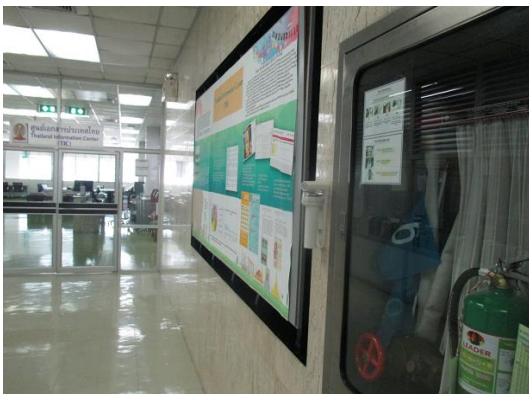
Fig. 2. LED lamps at Chulalongkorn University Central Library (left), Fire cabinets with transparent doors (right)

In October 2019, the Office of Academic Resources made the Chamchuri 10 Building library completely unmanned - there are no staff at all working there. Users simply scan a card to enter the building, select the books they would like to read and they are delivered via the innovative Mobile Telepresence Robotics (MTR) system. When the library is about to close an alarm will remind everyone and then the door will be automatically closed. 4