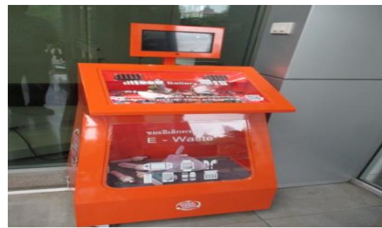
Fig. 3. Water purifier, waste sorting (left), e-waste collection box (right)