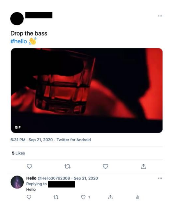
Figure 4. Conversation between Hello30762308 and Twitter users