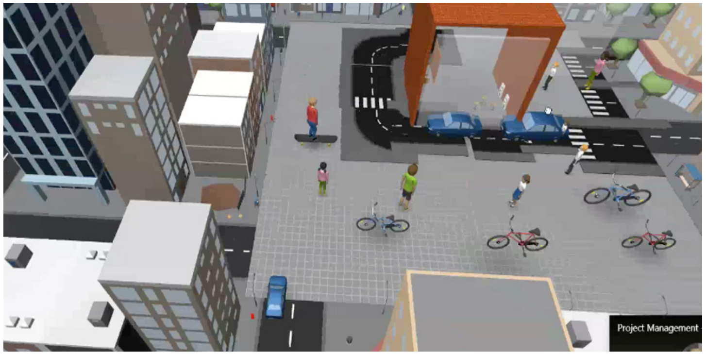
High school P example of Phase 4: Presentation of the modern transportation concept in a 3D computer model

The Fresno State Transportation Challenge (FSTC) uses an action civics approach to support K–12 students in developing transportation related projects that have a positive impact on the community and raise student awareness of transportation related careers. The focus was on two high schools. One school focused on the topic of active mobility, specifically on biking, addressing the challenge of how to get more students to bike to school. The other school combined the transportation challenge with an economic vitalization project. The students were asked to develop a modern transportation concept.