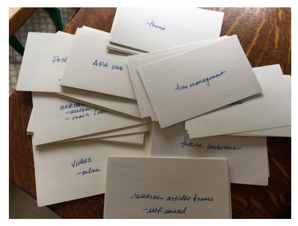
Figure 2: Cards labelled by student-researchers with 'that which informs' their masters' work