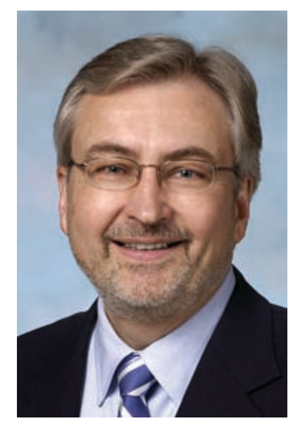
Welcome from the Provost

Welcome to the University of Central Oklahoma.