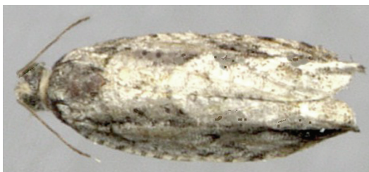
Figure 7. Pecan bud moth ( Gretchena bolliana )