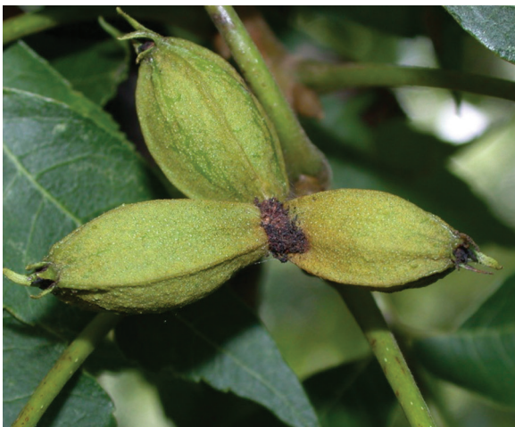
Figure 6. Insect excrement (frass) indicating larval entry into nuts.

season, each small larva forms a tightly woven, protective silken case (hibernaculum) near a bud or leaf scar for overwintering. These larvae emerge from hibernacula in the spring and feed by tunneling into shoots. Pupation of the overwintering generation occurs in these tunnels formed from feeding, and adults emerge the following spring to deposit the first generation of eggs on pecan nuts.