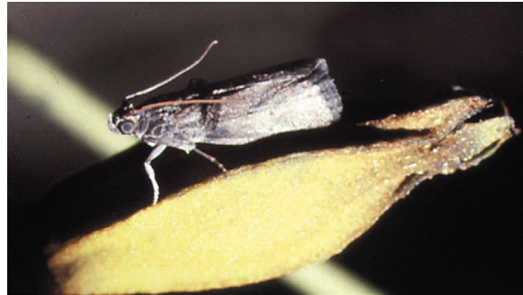
Figure 1. Adult pecan nut casebearer.

Oklahoma Cooperative Extension Fact Sheets are also available on our website at: http://osufacts.okstate.edu