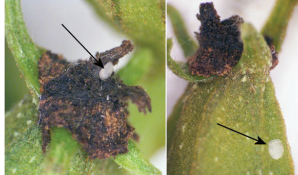
Figure 2. Pecan nut casebearer eggs.