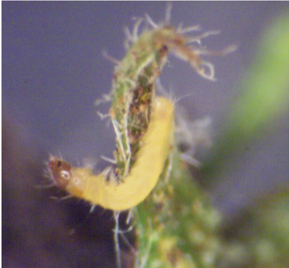
Figure 4. First instar pecan nut casebearer before it enters the nut.