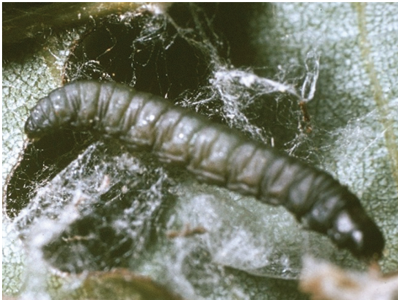
Figure 5. Mature pecan nut casebearer larva.