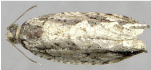
Figure 7. Pecan bud moth ( Gretchena bolliana )

males generally occurs 12 to 16 days before the optimum time for application of insecticides. Do not be tempted to apply an insecticide during peak moth capture, since this will usually occur a week or more before a properly timed treatment. In addition, a heavy moth flight may not necessarily translate into a successful and/or heavy oviposition (egg-laying) cycle. In Oklahoma, during the period that mating and subsequent oviposition occurs, moths are exposed to many environmental influences that can affect survival and successful propagation. Strong winds and storms may occur and result in high levels of mortality of adult moths. In addition, many predators and parasites feed on casebearer eggs. These will be discussed in a subsequent section of this publication.