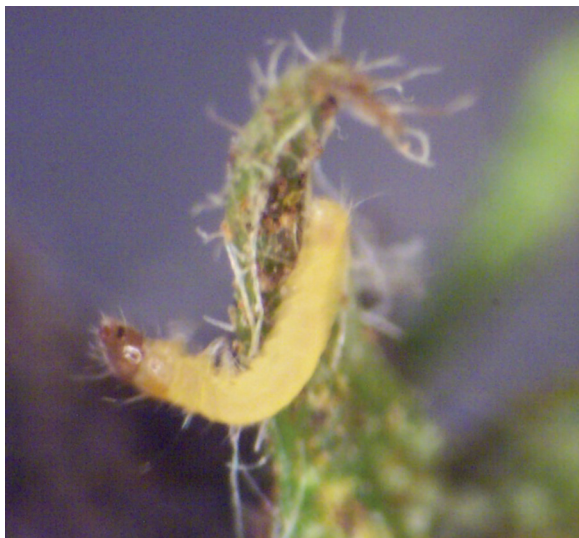
Figure 4. First instar pecan nut casebearer before it enters the nut.