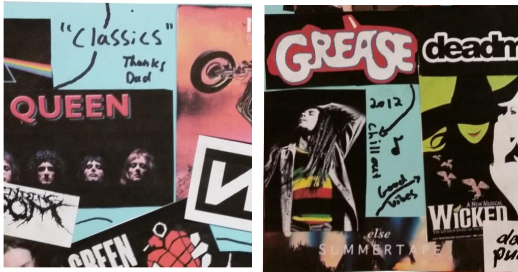
Figures 3a (left) and 3b. details from “Thanks Dad” collage

The next portrait features arrows and years to indicate a timeline of birth to when the self-portrait was created (1992-2016). It includes a handwritten message, “‘Classics’ thanks Dad” between album covers of Pink Floyd, Queen, and Meat Loaf (Figure 3a). The label “High School!!” is placed next to the Grease movie musical logo and a Green Day album cover; along with the label #Party next to logos for Job for a Cowboy (a death metal band) and deadmau5 (electronic dance music, i.e., EDM). A line leads the viewer to the year 2012, which includes an image of reggae musician Bob Marley beside the phrase “chill out” (Figure 3b). Subsequently the eye travels to the words “good vibes” which point from an album by French electro duo Else to the logo for the hit musical Wicked, the words “daft punk” (another electro music duo), an album by Russian electro-house producer/performer Zedd, and Norwegian hip hop duo Madcon. The autobiographical journey outlined in the student’s self-portrait could be read as a coming of age, beginning with the “classics” of American classic rock, to musical experiences in high school (“party” period), to a more mature period of “chill out” and “good vibes” music beginning in 2012, which would coincide with the student’s entry into undergraduate study.