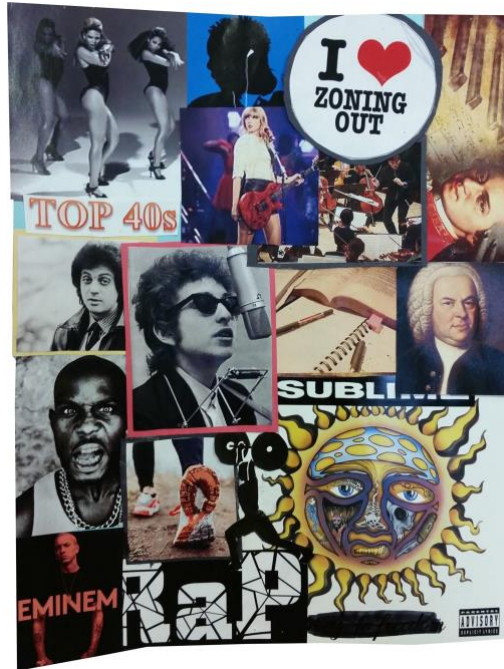
Figure 1. Musical self-portrait created by a preservice generalist teacher for a music education class assignment

identities that lay outside social norms. The findings contribute to an understanding of how students may groom their self-image and construct a public identity to fit the institutional and cultural ethos of preservice teacher education programs.