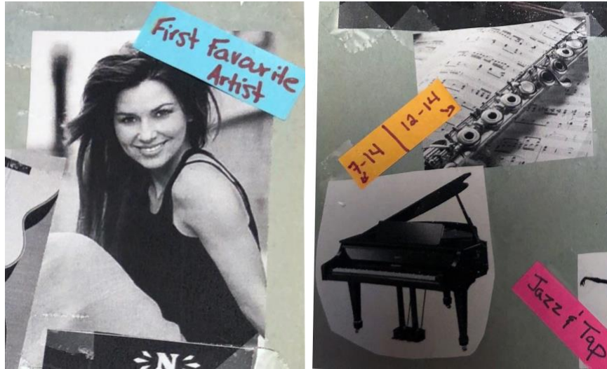
Figures 2a (left) and 2b. “First Favourite Artist”; details from a sample collage 4

At the top of the self-portrait are four photographs of pop musicians: Ed Sheeran, Taylor Swift, Backstreet Boys, and Shania Twain. Attached to the photograph of Shania Twain is a label indicating “First Favourite Artist” (Figure 2a). In the centre of the self-portrait are personal photographs of a campfire gathering, two people outside a theatre where the musical Newsies is on the marquee, and a photograph of a musical theatre cast that includes a label and arrow to the word “me!” At the bottom of the self-portrait are images of a grand piano, a flute, and a graphic of silhouetted dancers with the label “Jazz & Tap.” The piano carries the label “7 - 14” and the flute has the label “12 - 14” (Figure 2b). We interpret these labels to indicate the ages at which the student studied these instruments. The labelling is part didactic, part storytelling, and creates a chronology of identity formation. The placement of the images also reveals to us that the student self-identifies as ‘musical’ or as ‘musician’. The images of the professional musicians have been positioned at the top, but the images of the student herself performing or engaged in formal music education take up the most ‘real estate’ on the page. We read this as the student wanting us to know that they have formal music education in their background and that they are experienced in studying, consuming, and creating music. It conforms to the ideal of the good teacher.