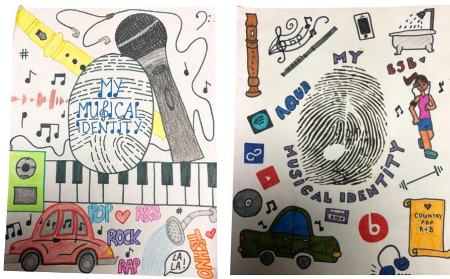
Figure 6a (left) and 6b. Two collages with striking similarities

While completing our analysis of the student self-portraits, we had noticed similarities, and repetition of certain symbols or images. These two self-portraits are virtually identical, with each student using a hand-drawn approach and elementary-style drawing technique: colourful, rounded images; big block letters; and crayons or markers (Figures 6a and 6b). The self-portraits contain much of the same visual content, including a thumbprint, a shower, a car, and headphones. Both self-portraits include representations of elementary music instruction: a large recorder and music notation symbols (music notes, clefs, staff). Both include ways to consume music (headphones and digital music players), and activities associated with music consumption (a car in motion, a shower). The image of the musical thumbprint that appears in both of these self-portraits also shows up in other self-portraits. When we did a Google search for “musical identity” (a phrase from the assignment instructions), variations of this thumbprint image appeared in the top five search results. This form of imitation plugs into the digital zeitgeist, in which communication uses the shorthand of popular images and viral memes to express political or social identity (Bruns, 2006).