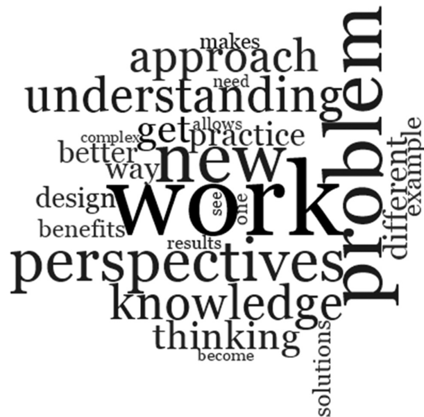
Fig. 3. What are benefits of interdisciplinarity? A word cloud of the top 25 synonymous words using authors' own descriptions of the benefits of interdisciplinarity. Larger fonts indicate greater word frequency. "Work" is the most frequent word constituting synonyms like bringing, exploit, form, processes, and make. (Word cloud created with Nvivo v. 12, QSR International Inc., Burlington, MA.)

"As a behavioural ecologist by training, I would have little success interpreting patterns of population size in some Arctic seabirds if I did not have some appreciation for oceanography and climate research, but I would also miss much if I didn't understand international politics as they relate to wildlife management, or if I failed to look into oral history of aboriginal peoples to assess long-term cyclical patterns in wildlife abundance."