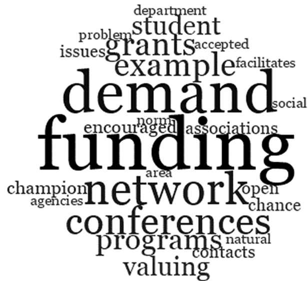
Fig. 6. What are facilitators to interdisciplinary research and scholarship? A word cloud of 25 stem words from coded text of authors' discussion on facilitators to interdisciplinary research and scholarship. Larger words illustrate greater frequency. Unlike the meaning of the word "funding" in Fig. 5, here it refers to funding agencies and programs as being key to facilitating and promoting interdisciplinary work. (Word cloud created with Nvivo v. 12, QSR International Inc., Burlington, MA.)

However, it can often be a challenge to find such conferences and spaces that are inherently interdisciplinary in scope. A good model for enabling such workshops are the "synthesis centers" in the United States that bring together diverse scholars to tackle interdisciplinary problems (see Baron et al. 2017).