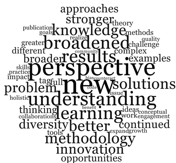
Fig. 2. What does interdisciplinarity mean? A word cloud of the top 50 words from text written by the authors describing what interdisciplinarity means to them. Larger words illustrate greater frequency counts. (Word cloud created with Nvivo v. 12, QSR International Inc., Burlington, MA.)

“I consider it a mostly meaningless academic buzzword. I do use it, however, but largely in grant applications and similar genres of writing in which I try to give institutions the kinds of text that I presume they are looking for.”