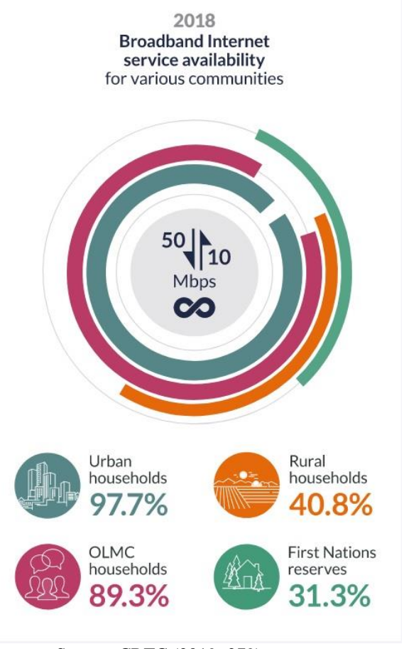
Figure 1. Broadband Internet Availability, 2018