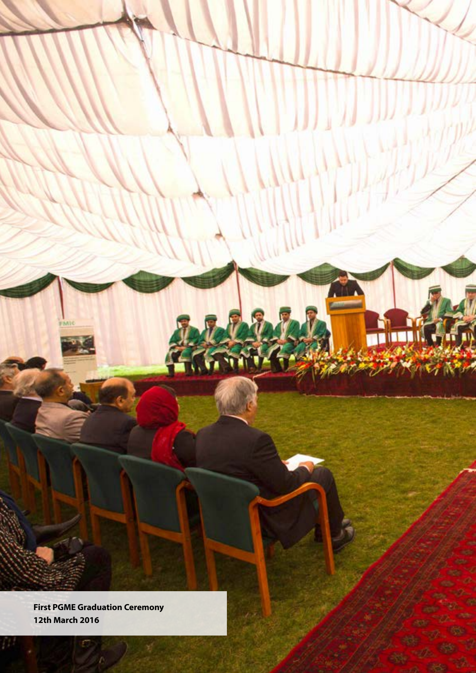
First PGME Graduation Ceremony 12th March 2016