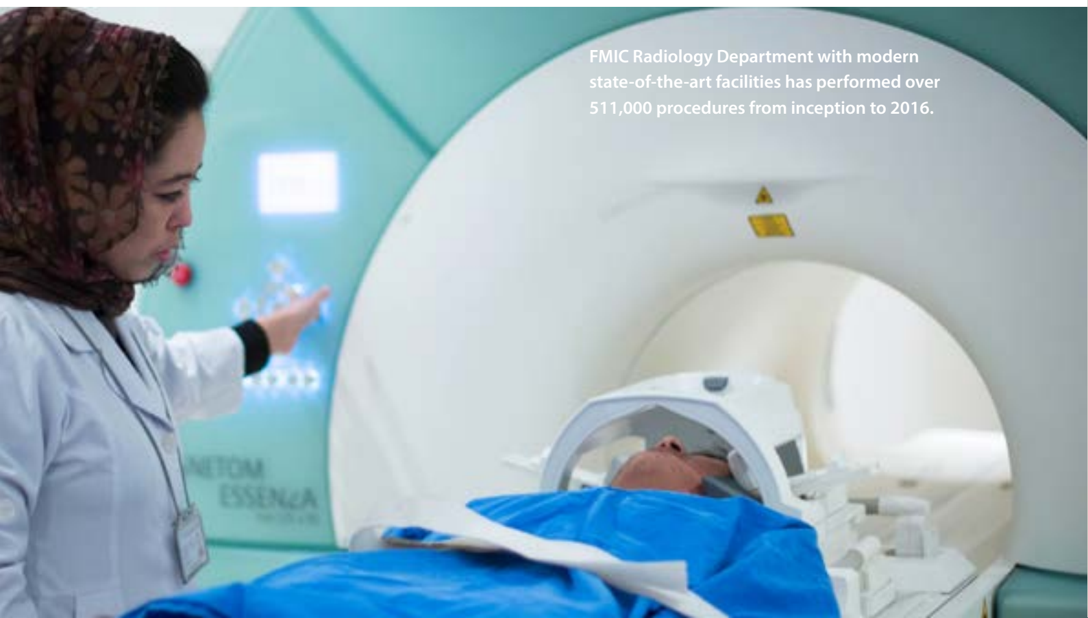
FMIC Radiology Department with modern state-of-the-art facilities has performed over 511,000 procedures from inception to 2016.